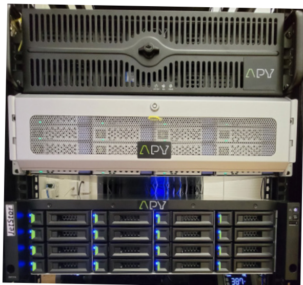
5600 K's JetStor 816FX FC SAN Platform (bottom) and a Server from APY (top)

The JetStor device features dual-active controllers that operate concurrently. This architecture doubles the available host bandwidth, enhances utilization of system resources, and maximizes throughput.