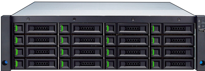
JetStor 816FX Fibre Channel SAN Platform

AC&NC™ / JetStor meets the evolving needs for data storage, protection, and management. We leverage leading technologies to offer high-value solutions for NAS, SANs, clouds, and hyper-converged infrastructures (HCIs). Since 1994, our customers have spanned virtually every industry, and range from Fortune 500 enterprises to small and medium-sized firms. We support environments from data centers and clouds to branch offices and remote sites.