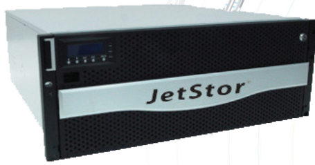
JetStor SAS 724HS 10G