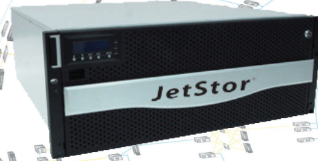
JetStor SAS 724HSD 10G

The JetStor SAS 724HS 1G/10G Series of RAID systems deliver Hybrid Storage performance through 2x 10GbE iSCSI and 2x 1GbE iSCSI host port connections per controller to enable the most demanding applications. Outstanding throughput coupled with fast random access eliminates bottlenecks in your most demanding applications, diminishing response times and increasing productivity. The JetStor SAS 724HS 10G RAID systems accelerate databases, file servers, production applications, imaging, and any application demanding the instantaneous delivery of records, small and large files.