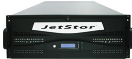
JetStor SAS 760iSD 10G

The JetStor SAS 760iSD 10G RAID system delivers increased performance and efficiency through 2 x 10Gb & 2 x 1Gb Ethernet host connections to enable the most demanding applications. Outstanding throughput coupled with fast random access eliminates bottlenecks in your most demanding applications, diminishing response times and increasing productivity. The JetStor SAS 760iSD 10G RAID system accelerates databases, file servers, production applications, imaging, and any application demanding the instantaneous delivery of records, small and large files.