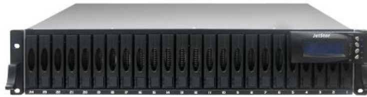
JetStor SAS 724S V2

The JetStor SAS 724S V2 RAID system delivers 1,600 MB/second through 6Gb/sec SAS2 host connections to enable the most demanding applications. Outstanding throughput coupled with fast random access eliminates bottlenecks in your most demanding applications, diminishing response times and increasing productivity. The JetStor SAS 724S V2 RAID system accelerates databases, file servers, production applications, imaging, and any application demanding the instantaneous delivery of records, small and large files.