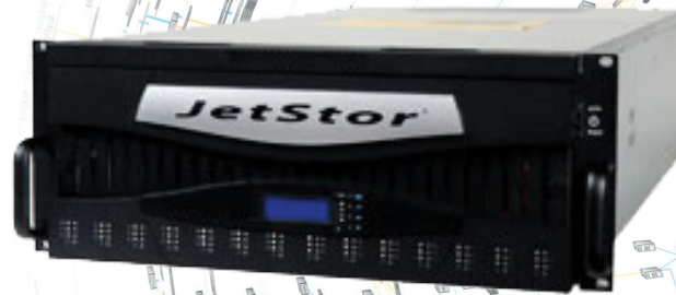
JetStor SAS 742J

JetStor SAS 742J is a 19-inch 4U rackmount JBOD unit. It comes with 42 hot-swappable bays and ideal for high capacity and scalability storage in most popular OS environments. Based on 6Gb SAS Channel host interfaces, the JetStor SAS 742J supports SAS2 or SATA3 drive configurations to deliver the best cost-performance index with higher bandwidth.