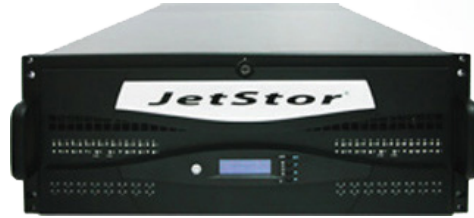
JetStor SAS 760iS

The JetStor SAS 760iS RAID system delivers increased performance and efficiency through 6 x 1Gb Ethernet host connections to enable the most demanding applications. Outstanding throughput coupled with fast random access eliminates bottlenecks in your most demanding applications, diminishing response times and increasing productivity. The JetStor SAS 760iS system accelerates databases, file servers, production applications, imaging, and any application demanding the instantaneous delivery of records, small and large files. The JetStor 760iS also supports optional dual controllers which provide better fault tolerance and higher reliability of system operation.