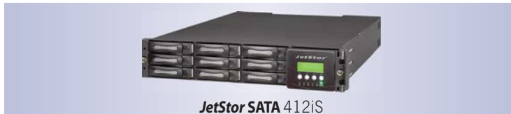
JetStor SATA 412iS