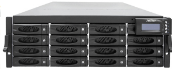
JetStor SAS 716F V2

The JetStor SAS 716F V2 RAID system delivers 1,600 MB/second through 8Gb/sec SAS2 host connections to enable the most demanding applications. Outstanding throughput coupled with fast random access eliminates bottlenecks in your most demanding applications, diminishing response times and increasing productivity. The JetStor SAS 716F V2 RAID system accelerates databases, file servers, production applications, imaging, and any application demanding the instantaneous delivery of records, small and large files.