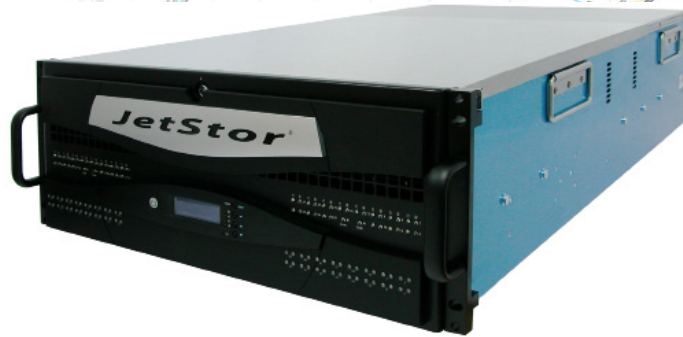
JetStor SAS 764J

JetStor SAS 764J is a 19-inch 4U rackmount JBOD unit. It comes with 64 hot-swappable bays and ideal for high capacity and scalability storage in most popular OS environments. Based on 6Gb SAS Channel host interfaces, the JetStor SAS 764J supports SAS/SAS2 or SATA2/3 drive configurations to deliver the best cost-performance index with higher bandwidth.