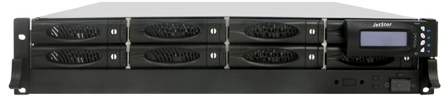
JETSTOR NAS 800S V2

The JetStor NAS 400S / 800S V2 Storage Appliance offers small and mid-sized companies a reliable, easy to use, cost-effective and yet powerful NAS system. This high-performance, LAN-attached device is designed to provide shared storage to both clients and servers in Windows, UNIX, Apple Macintosh, VMware or mixed environments. Engineered to meet stringent demands for continuous availability, JetStor NAS 400S / 800S V2 features cableless design and dual Gigabit Ethernet ports, all encompassed in a small 1U enclosure. The JetStor NAS 400S / 800S V2 uses Two (2), Gigabit Ethernet using NAS/iSCSI protocol host connections and offers iSCSI target (IP SAN) for remote servers to backup and share data.