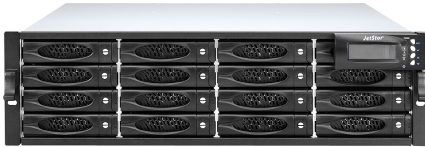
JetStor SAS 716iS 10G V2

Adding storage capacity is now as simple as plugging a cable into an available port on an Ethernet switch. Brand new JetStor SAS Model 716iS 10G V2 16 bay RAID array delivers reliable data protection combined with the ease of use and compatibility advantage of iSCSI to support your organization storage requirements. No infrastructure upgrades are needed - iSCSI JetStor will provide block-level storage across your existing network. Two 10Gb/s iSCSI and Two 1Gb/s iSCSI ports provide enough bandwidth to satisfy modern-day server demands.